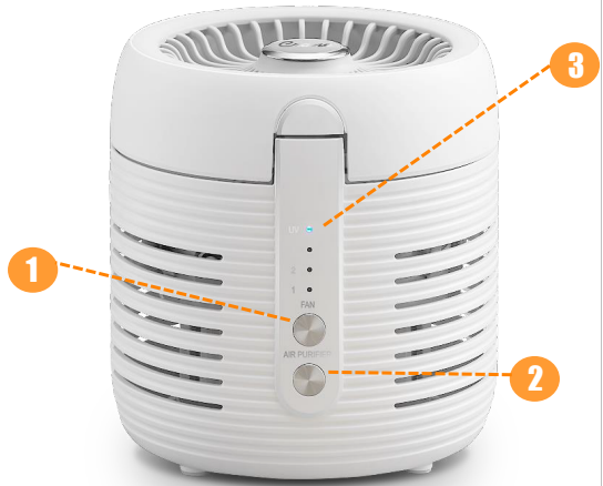
Fig. 2 (Main)